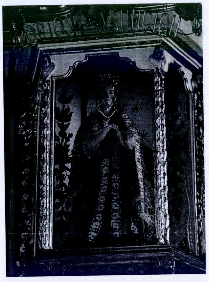
La Virgen de la Asunción in Cheranastico.

she is adorned with a necklace made of American dollar bills. The music which community members listen and dance to during their leisure time resembles a pastiche of disparate musical choices, including the ranchero music of Northern Mexico with its narcocorridos and Purépecha rock music. He explains with regard to this kind of apparent juxtapositioning that: