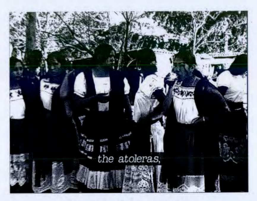
Screenshots from Día 2, "Las bellas del atole".

spheres. This is why it is able to merge topics, which according to dichotomising racialised categories, are often isolated from each other: Indigenous people and "Western" eroticism. It reconstructs and relates "the indigenous" and "The Western". Watching or referring to Cerano's film, a spectator can therefore position themself explicitly between cultures. An indigenous spectator is for example able to relate to its bifocality in regard to "the indigenous" and "The Western", thereby reframing the meaning of local practices such as wedding celebrations, dancing and flirtation in relation to diverse cultural standards. This bifocality creates an alternative to the established stereotype of the asexual indigenous people that is conveyed by Mexican mainstream cinema.