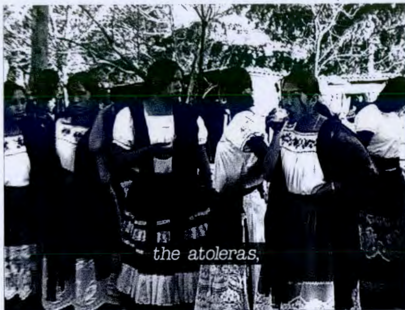
Screenshots from Día 2 , "Las bellas del atole".

spheres. This is why it is able to merge topics, which according to dichotomising racialised categories, are often isolated from each other: Indigenous people and "Western" eroticism. It reconstructs and relates "the indigenous" and "The Western". Watching or referring to Cerano's film, a spectator can therefore position himself explicitly between cultures. An indigenous spectator is for example able to relate to its bifocality in regard to "the indigenous" and "The Western", thereby reframing the meaning of local practices such as wedding celebrations, dancing and flirtation in relation to diverse cultural standards. This bifocality creates an alternative to the established stereotype of the asexual indigenous people that is conveyed by Mexican mainstream cinema.