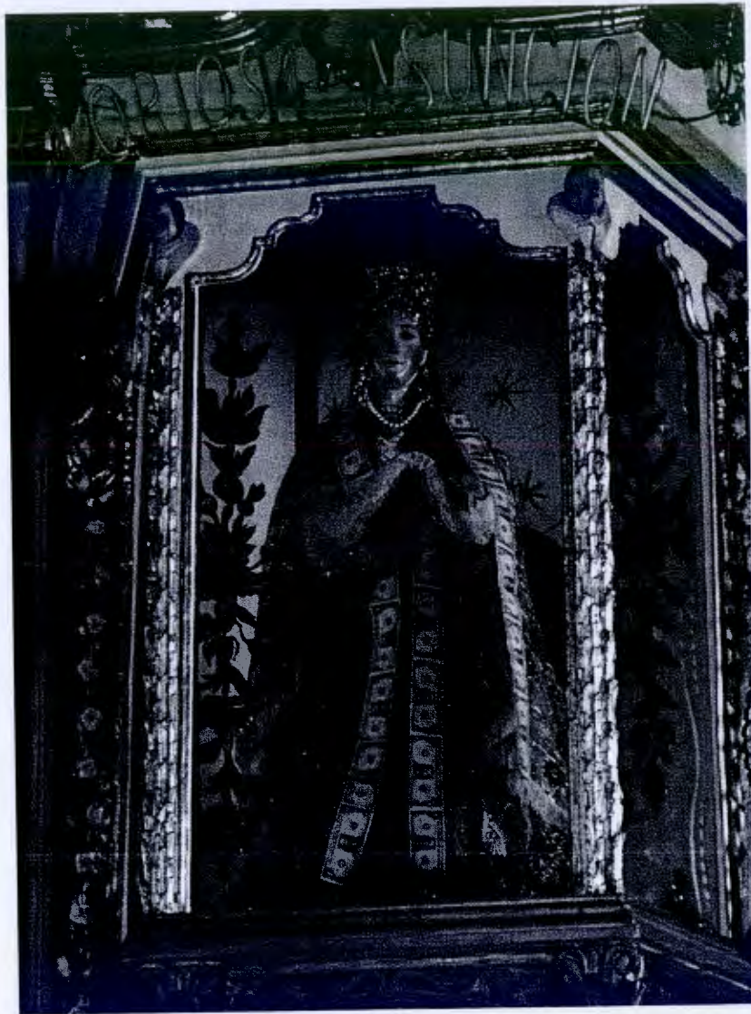
La Virgen de la Asunción in Cheranasteco.

she is adorned with a necklace made of American dollar bills. The music which community members listen and dance to during their leisure time resembles a pastiche of disparate musical choices, including the ranchero music of Northern Mexico with its narcocorridos and Purépecha rock music. He explains with regard to this kind of apparent juxtapositioning that: