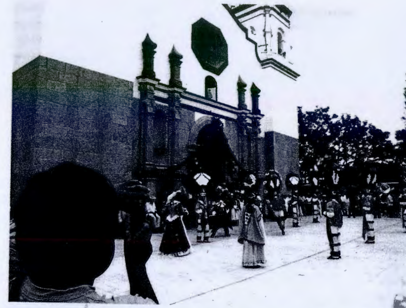
Cell phone filming at the Danza de la Pluma in San Bartolo Coyotepec, Oaxaca, Photo: Ingrid Kummels, 2010.

In further instances, video was seized upon by popular social movements due, by the most part, to its accessibility and low production costs compared to customary 16mm-cameras. Indeed, it was picked up by grassroots movements in Chiapas including, for example, the Zapatista movement (Halkin 2006). It was used as a means of documentation to be able to record the statements of political actors, in particular government representatives in the context of negotiation and conflict over cultural and political rights. Covering an event through visual media