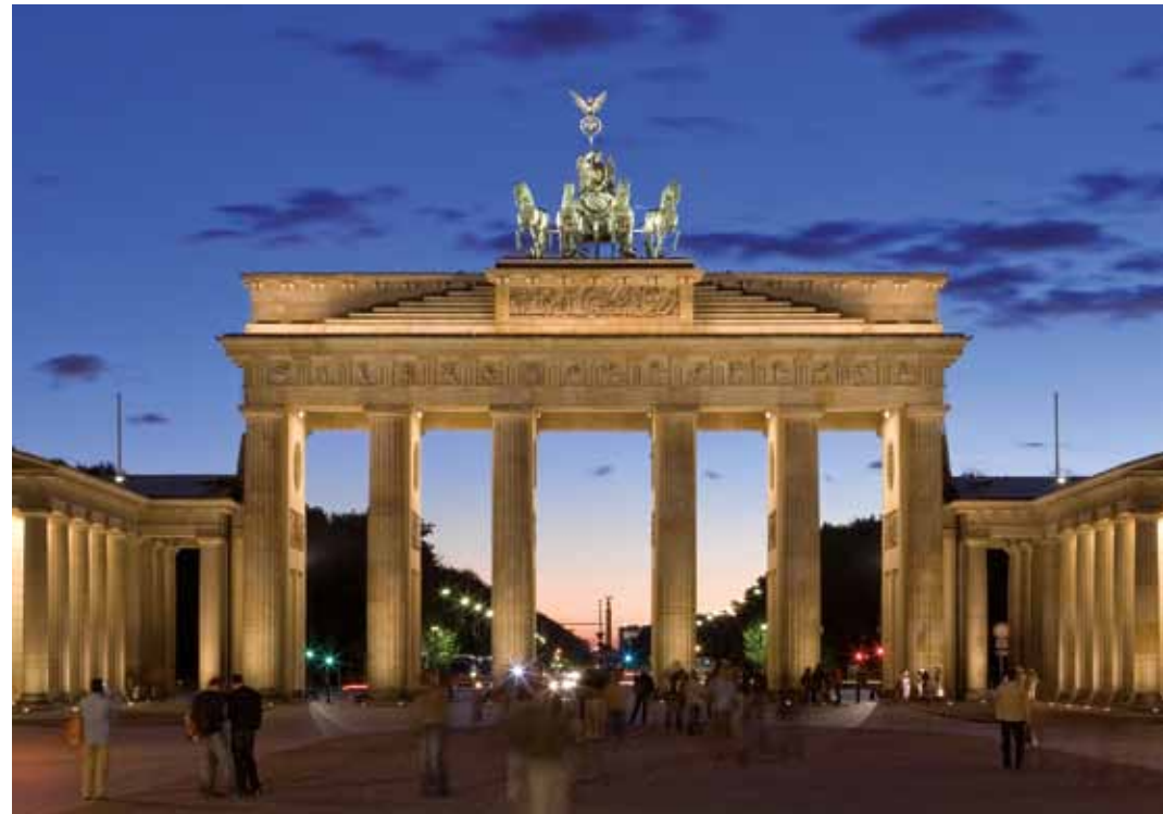
The Brandenburg Gate is one of Berlin's most important monuments – a landmark and symbol all in one.

The production of this brochure was sponsored by the German Academic Exchange Service.