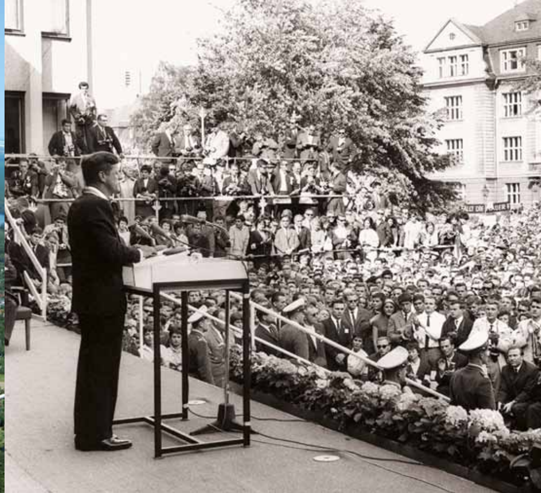
U.S. President John F. Kennedy holding a speech at Freie Universität Berlin in 1963.