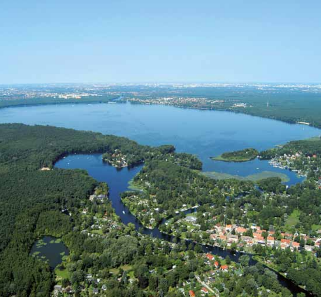
Berlin's great wealth of urban green space helps provide a high quality of life.