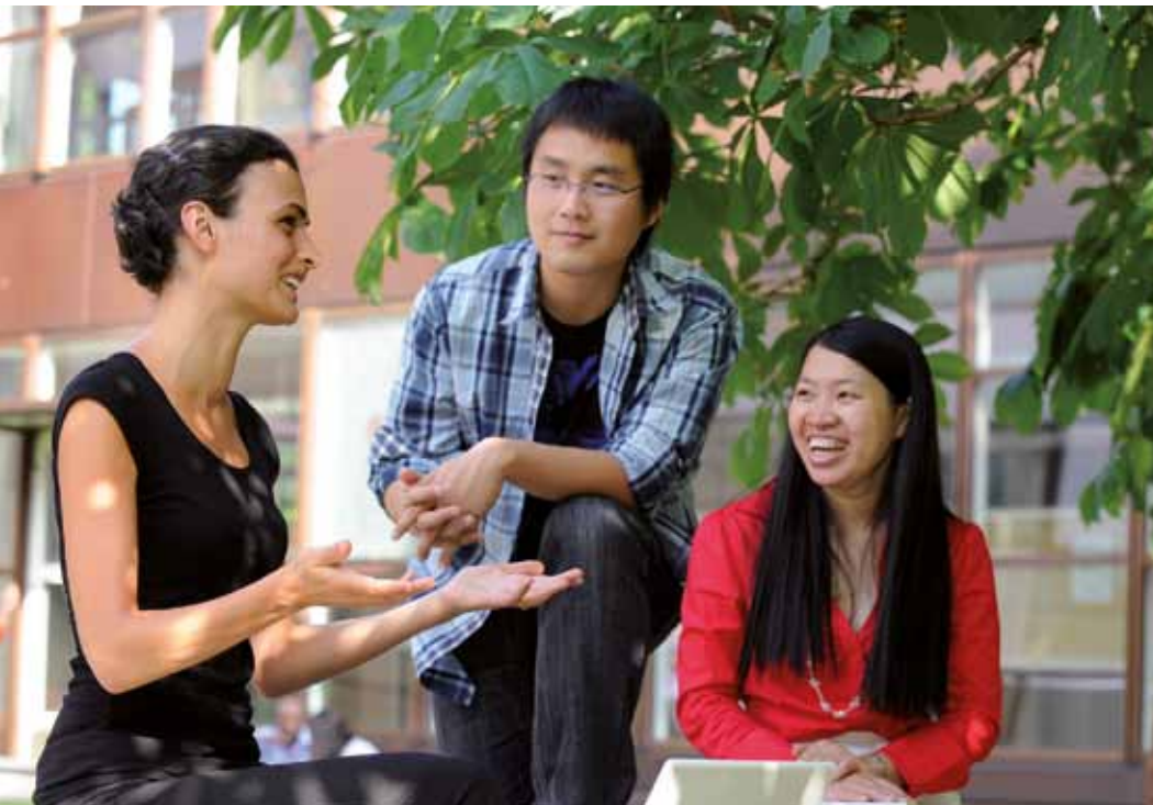
Roughly 28,500 young people study at Freie Universität Berlin.