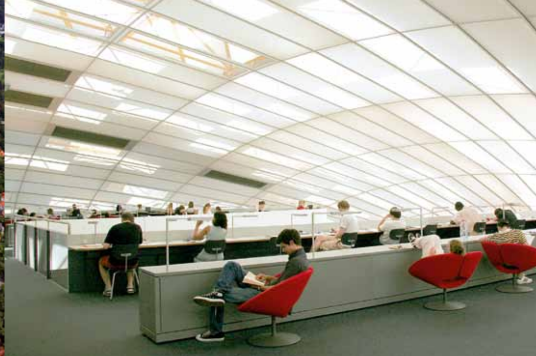
Designed by architect Lord Norman Foster, the library building has been the recipient of many awards.