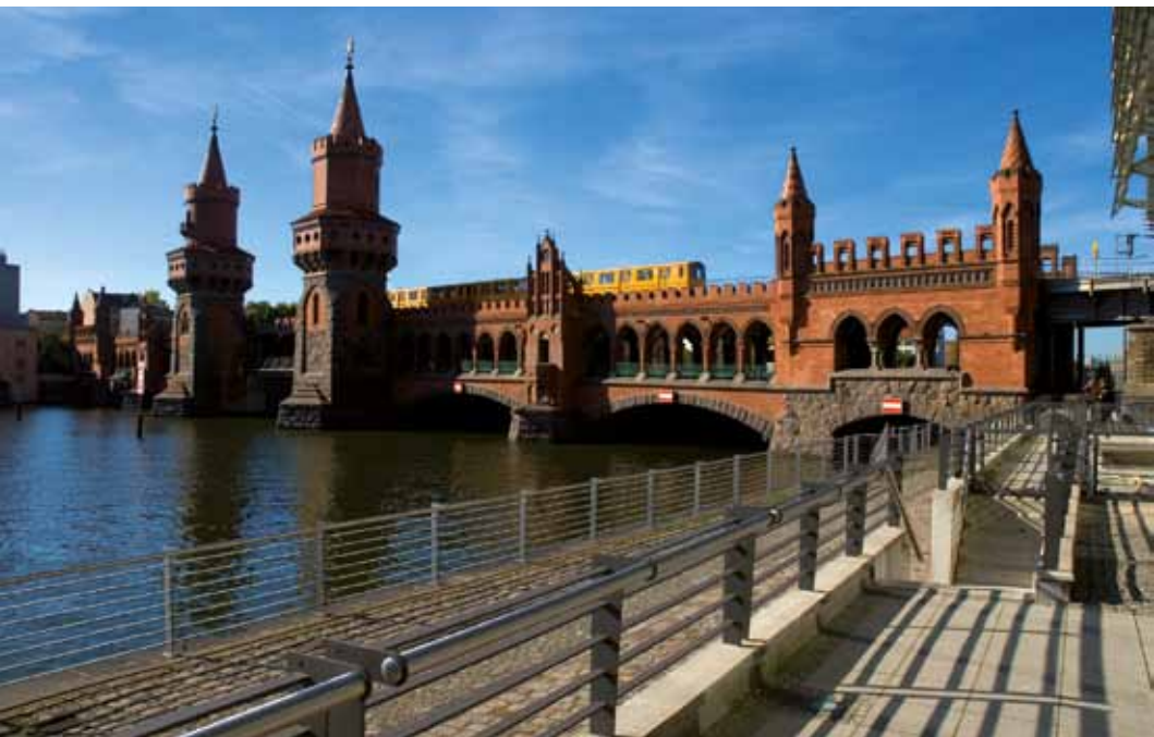
An easy way to get around is to use the extensive public transportation system.