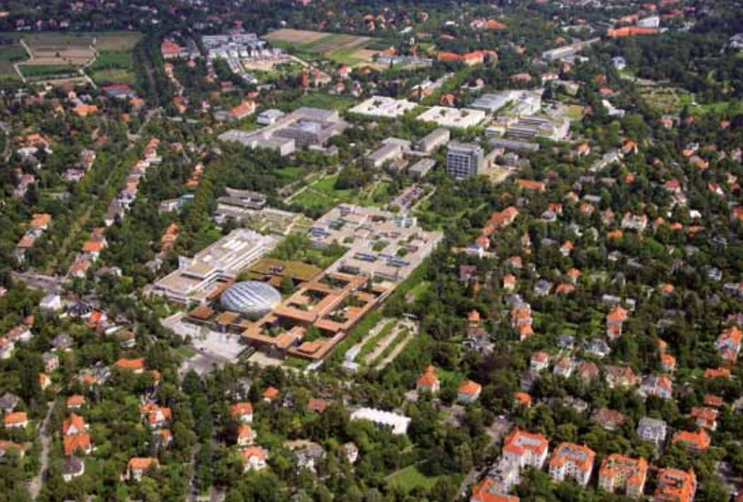
The Philological Library is surrounded by the building complex housing the humanities and social sciences.

The Dahlem campus hosts 12 of the university's 15 departments and central institutes, more than 20 libraries, various student cafes and dining halls – including Germany's first vegetarian university dining hall, university sport facilities, and the Botanic Garden. The campus is surrounded by wonderful green gardens and lakes. Some of Freie Universität's institutes are located in the nearby districts Düppel and Lankwitz.