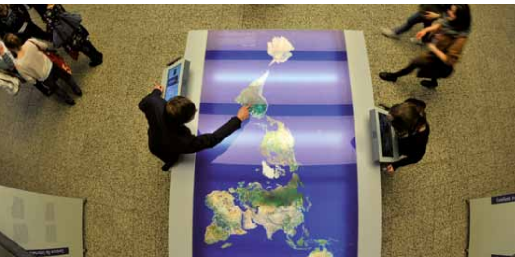
People from 125 countries are involved in undergraduate and graduate study and teaching activities.